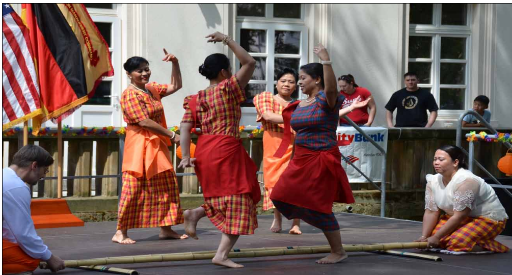
Dancers perform during last year's Asian-Pacific American Heritage Month celebration. This year's event will feature local performers as well dancers from Berlin.