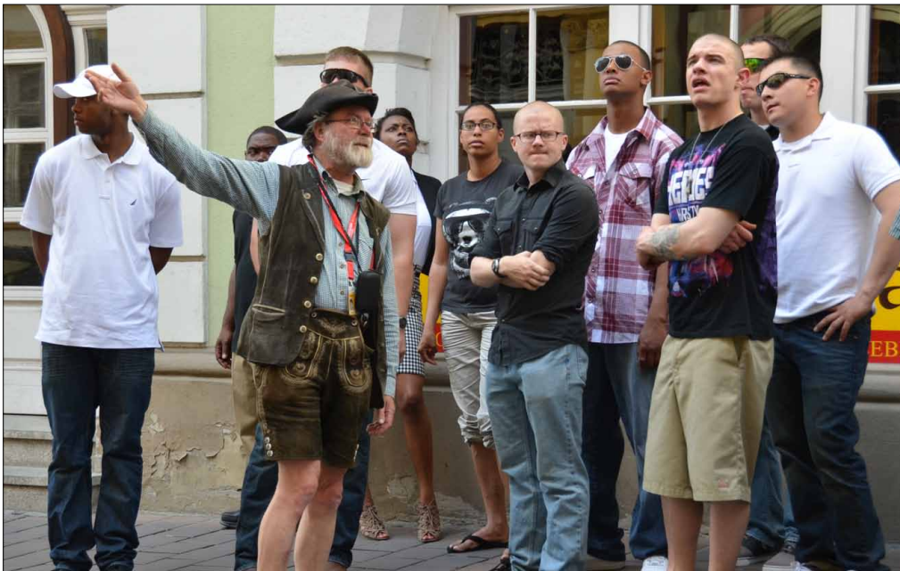
A local tour guide shows newly arrived Soldiers the sights of Bamberg on Friday as a part of German-American friendship week. The event takes place each year.

The tour group made their way through Bamberg's town hall buildings, Schlenkerla Brewery, the New Residence and the Bamberg Cathedral.